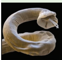
Electron micrograph of an adult lungworm

Lungworm are swallowed as tiny larvae, which migrate into the circulation of the liver and travel to the right side of the heart. Here they develop into adult worms (see photo left) which can build up in the heart. Here the adults mate and produce eggs. The eggs hatch into larvae and then migrate into the lung tissue. These larvae are coughed up and are passed out into your dog's faeces to re-infect molluscs.