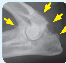
Arthritic elbow joint in a dog with lots of "fluffy" new bone (yellow arrows) around the joint, indicative of marked arthritis.