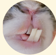
Misaligned and overgrown incisor (front) teeth