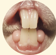
Healthy incisor teeth should normally meet – as above